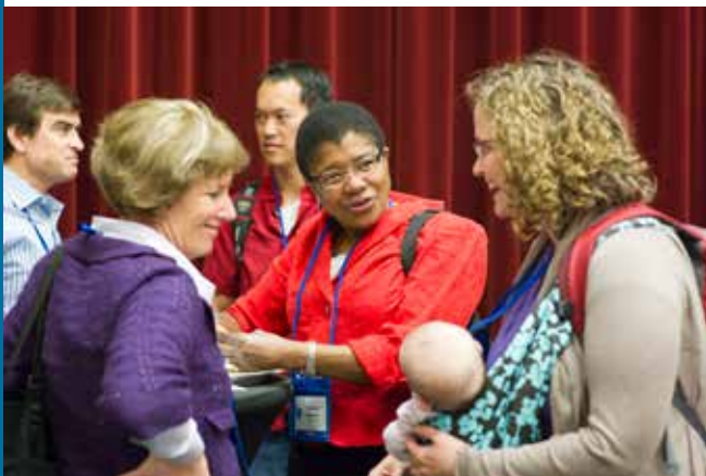
▼ Delegates networking at CAEP.