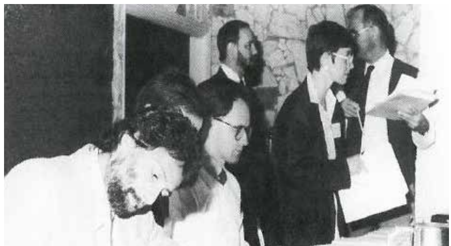
▲ Preparing for the annual CAEP meeting.