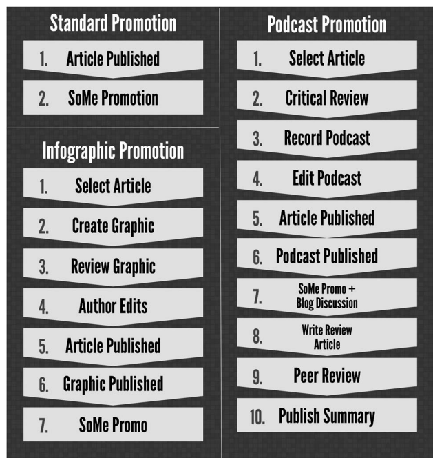
Figure 1. Graphical representation of the social media promotion process for control, infographic, and podcast groups.

Readership was quantified using abstract page views 20 and full-text page views on the CJEM website in the month of formal publication and the two subsequent months. This timeline was selected to ensure that the full impact of SoMe promotion was included while standardizing the time interval across issues. An abstract view was recorded each time that an article’s abstract