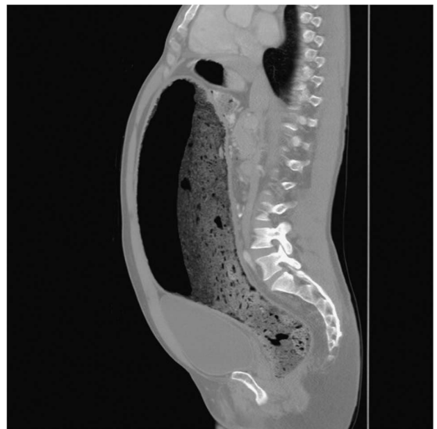
Figure 2. Sagittal image of distended sigmoid colon.

From the Department of Emergency Medicine, University of Maryland School of Medicine, Baltimore, MD.