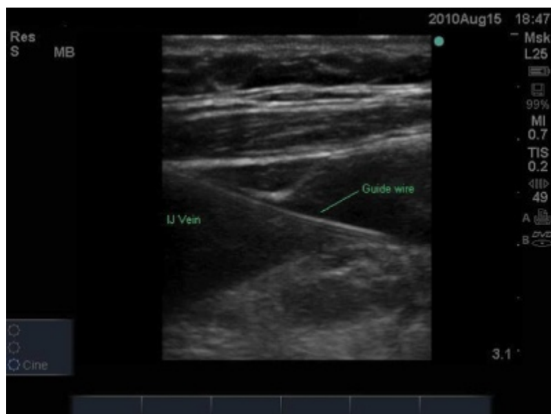
Figure 1. Guidewire visualized sonographically within the internal jugular (IJ) vein in a longitudinal imaging plane.

Participants were given a 5-minute demonstration on guidewire visualization followed by hands-on training with an inanimate vascular access model. The model was constructed using water-filled latex (Penrose) drains to simulate veins inside an opaque, congealed gelatin-psyllium mixture, as previously described. 12 Each simulated vein was 3 cm below the surface of the model and had an accompanying guidewire positioned either correctly within the vessel or incorrectly outside it. Participants were taught to visualize each wire in both longitudinal (Figure 2) and transverse (Figure 3) scanning planes. After watching the instructor demonstrate the appearance of correctly and incorrectly positioned wires, trainees were allowed to practice on the vascular access model. Each trainee scanned one simulated vein with an improperly placed wire and between one and four veins with properly placed wires. Trainees were advised to