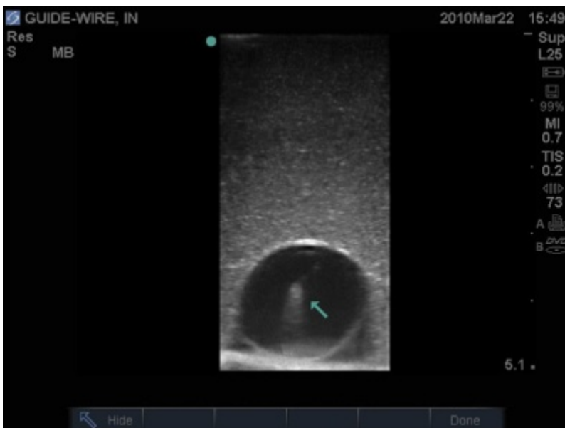
Figure 3. The guidewire (arrow) shown in a transverse imaging plane in a simulated vascular access model.

Sonosite M-Turbo (Bothell, WA) with a 6 to 13 MHz 25 mm linear array transducer to determine the location of each guidewire relative to the vein. Participants recorded their responses as “inside,” “outside,” or “unsure” on a data collection sheet. No instructors or other participants were allowed near the testing station while the examinee scanned the testing model and completed the data sheet. Subjects were asked not to discuss the examination until all participants had undergone testing. The test characteristics were determined using known wire position as the criterion standard.