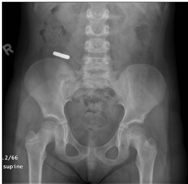
Fig. 1. Abdominal radiograph showing 2 magnets attached end to end in the lower right quadrant.

Although most foreign bodies that are ingested pass