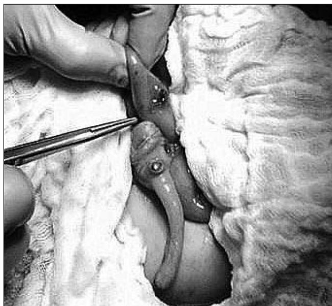
Fig. 2. Intraoperative photo showing 1 perforation in the ileum and 1 near perforation at the base of the appendix.

without complications, a history of possible magnet ingestion should be treated more cautiously. Likely due to the popularity of magnetic toy sets, there have been numerous case reports in the last 5 years of serious complications including 1 death from the ingestion of multiple magnets. Complications occur when magnets in different bowel loops attract each other and trap bowel wall tissue between opposed surfaces. This can lead to bowel necrosis, perforation, volvulus and sepsis. 4,7 In reviewing the previous case reports, which all required surgical intervention, 4,7 it is not clear how often cases of multiple magnet ingestions require no intervention. We were unable to find any cases of these reported in the literature. However, the number of case reports documenting severe complications from single battery ingestion suggests that morbidity is not uncommon.