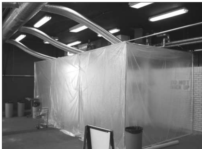
Fig. 2. Construction of examination rooms.

The SAC layout facilitated one-way patient flow. Secu-