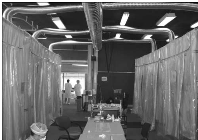
Fig. 3. Examination rooms with plastic covered curtains. Entrances were covered with sliding curtains.