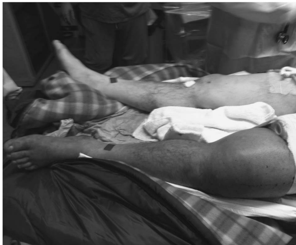
Figure 1. The patient lower limbs on arrival at our trauma center. Note the “paramedic belt” used as an improvised tourniquet. Part of the leather belt used as another improvised tourniquet can also be seen.