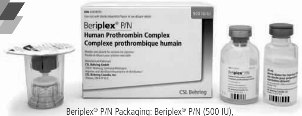
Beriplex ® P/N Packaging: Beriplex ® P/N (500 IU), Diluent Vial (20 mL) and Mix2Vial ™ . 1 Mix2Vial is a trademark of West or one of its Subsidiaries.