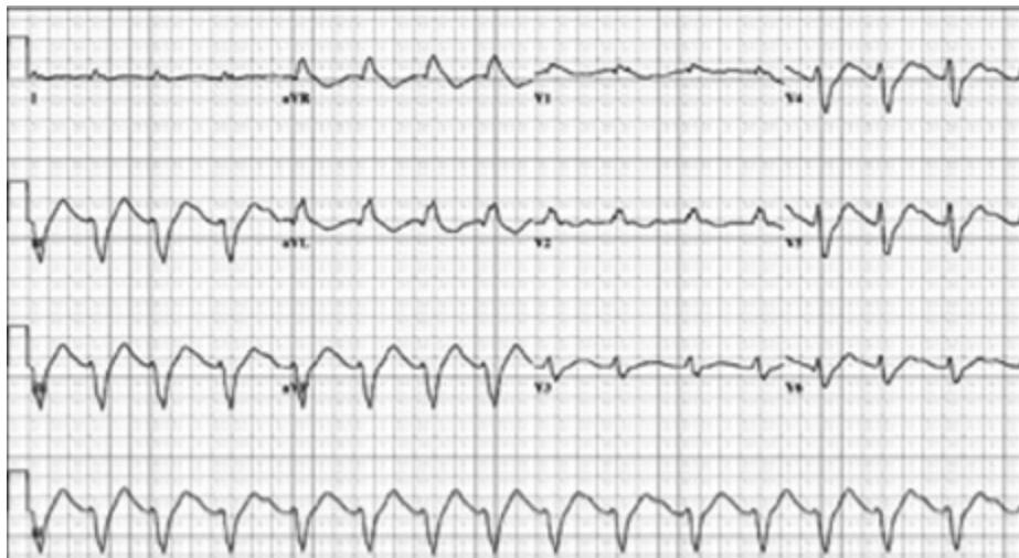
Figure 1. EKG demonstrating wide QRS and prolonged Q-Tc.

On arrival at the intensive care unit (ICU), the patient had lactate 7.6 mmol/L, pH 7.66, sodium 150 mmol/L, and potassium 3.0 mmol/L. She required a low-dose norepinephrine infusion intermittently for a target mean arterial pressure > 65 mm Hg, but after the initial resuscitation, hypotension was not a dominant feature. A sodium bicarbonate infusion was used for a target pH > 7.5, and the hypokalemia and hypocalcemia were treated. Over the next hour, the patient had three further episodes of pulseless wide-complex tachycardia, which were treated with synchronized cardioversion and each time reverted to a wide-complex sinus rhythm with a prolonged Q-Tc interval.